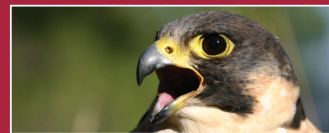
Peregrine falcon ( Falco peregrinus ). Josep Gener.

Sant Joan del Codolar [5.1]: (750 m) A hermitic spot in the Serra de Montsant in which people dedicated to prayer and meditation have settled since Mediaeval times, seeking isolation from the outside world. Beside the small shelter used as a hermitage, the Carthusians built a chapel in around 1499. Chapel of Sant Joan Petit: A small chapel on the access track. Grau de Montsant [5.2]: The old drove road, often used by the people of Cornudella. Font del Manyano [5.6]: Hidden between box shrubs, this spring has been used as a watering hole for herds of animals, and a wooden basin is still visible. Grau Gran [5.7]: Today, a track passes here that has made the old drove road that climbed to the Serra Major and led from Albarca to Cabacés disappear. Camí de la Llisera [5.8]: Path which traces a route above a stratum of rock.