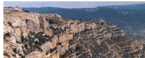
Cliffs of Sant Joan